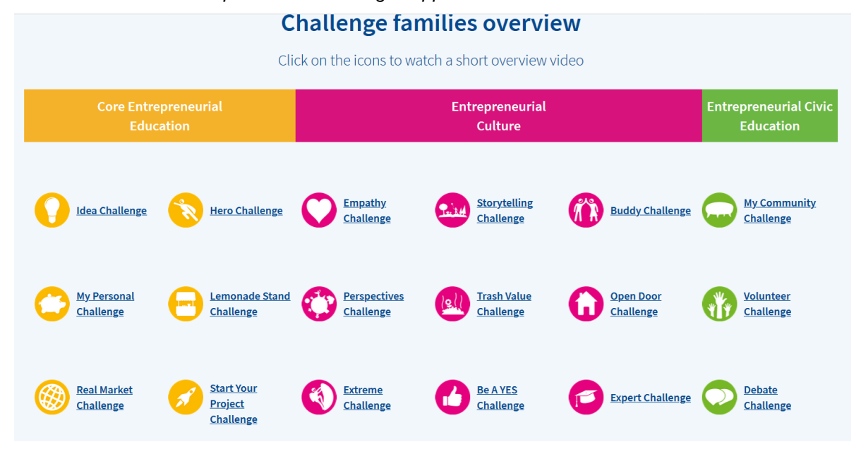
Exhibit 2: Youth Start Entrepreneurial Challenges applied at KPH Vienna/Krems11